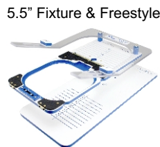
5.5" Fixture & Freestyle