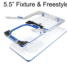
5.5" Fixture & Freestyle