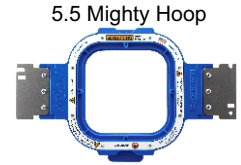
5.5 Mighty Hoop