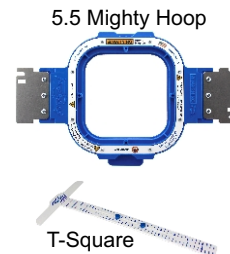
5.5 Mighty Hoop